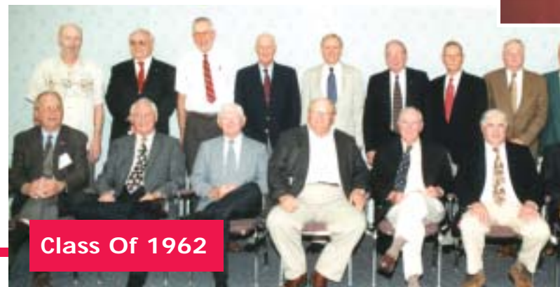
Class Of 1962