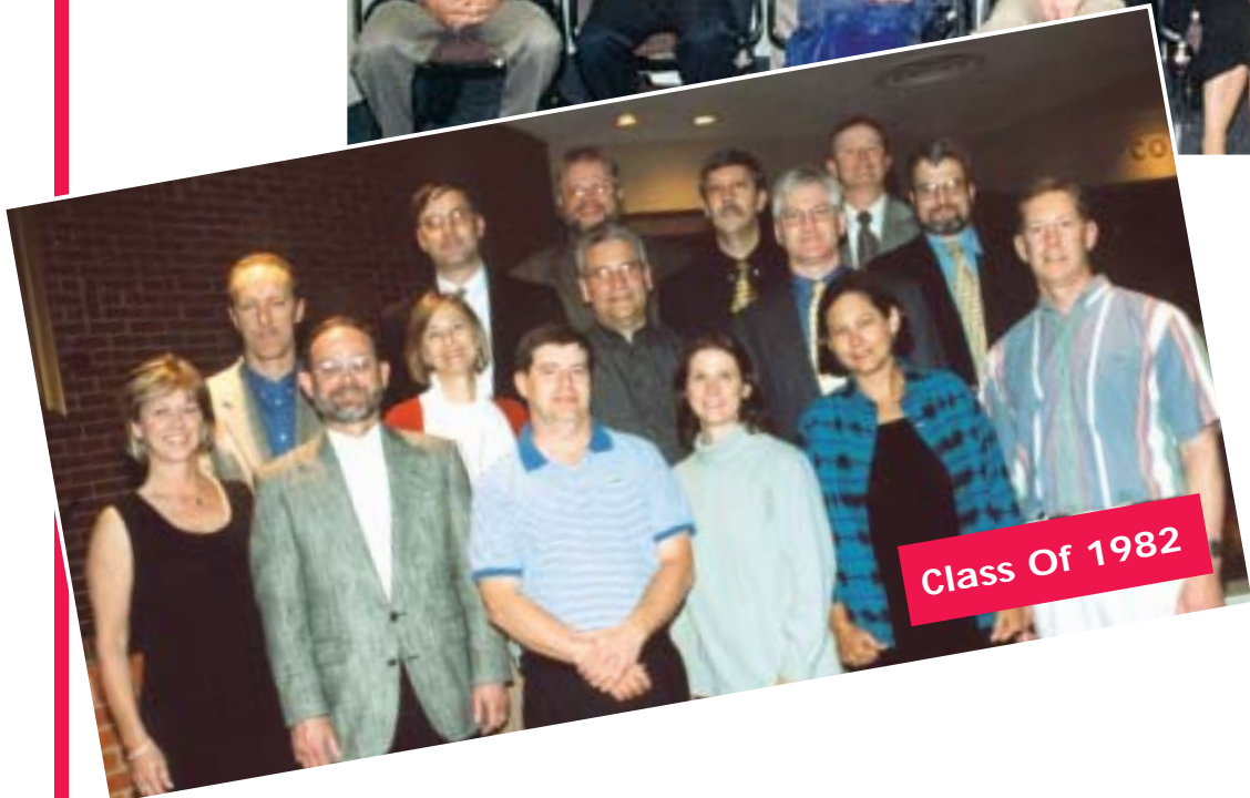
Class Of 1982