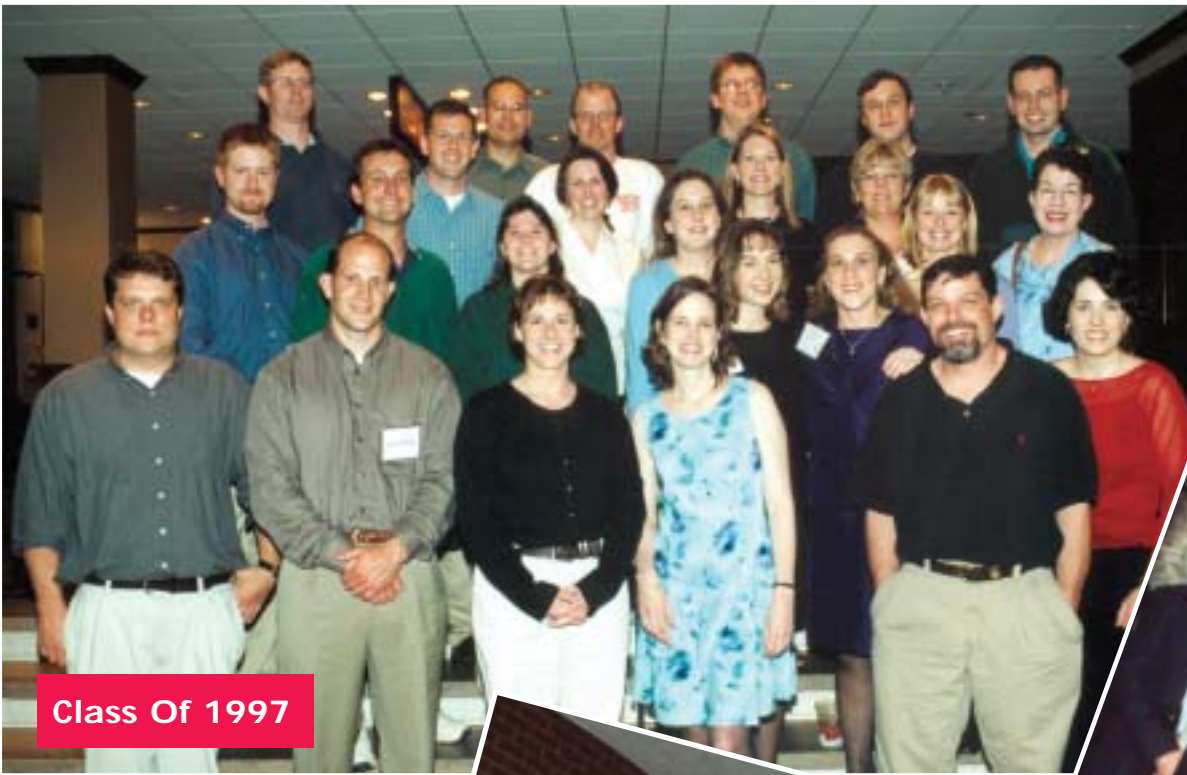
Class Of 1997