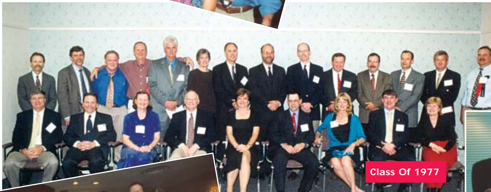
Class Of 1977