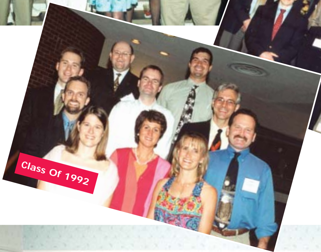
Class Of 1992