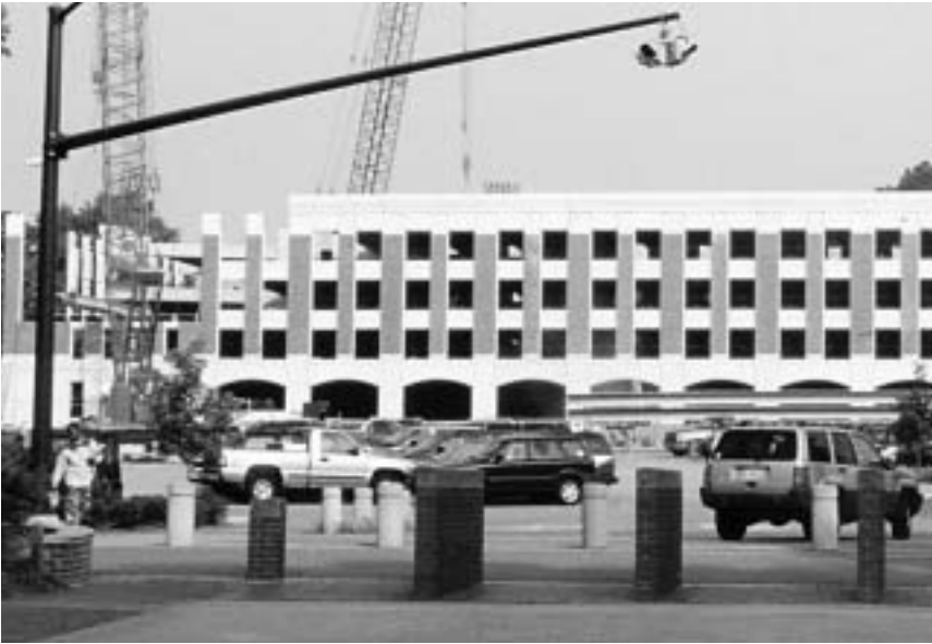
The new Carlton Street parking deck can accommodate about 800 cars.

Although the Carlton Street parking deck is not a cure-all for parking problems, the new facility is making life a little easier for CVM personnel and visitors.