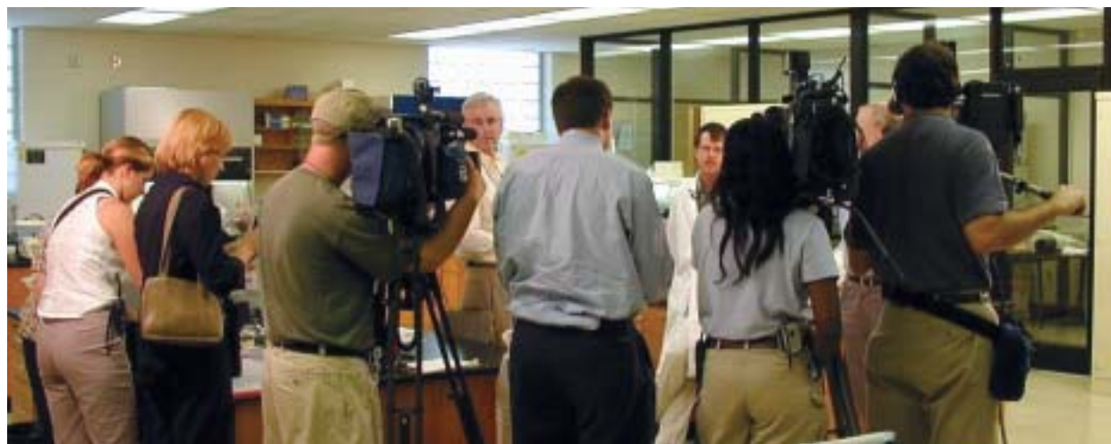
TV cameramen showed an irresistible interest in the work of research scientists at the Southeastern Cooperative Wildlife Disease Study who are testing birds for West Nile virus.

Crews from television and radio stations in and around Atlanta have been frequent visitors to the SCWDS labs, along with newspaper